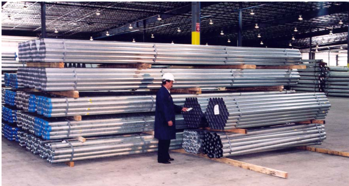
Lifts of Traditional 10 foot Rigid Metal (RMC) and Electrical Metallic Tubing (EMT) stacked in front of lifts of 20 foot.

Conforms to the same standards as the traditional 10 foot lengths of Rigid Metal Conduit (RMC) and Electrical Metallic Tubing (EMT). All manufacturing facilities registered to ISO9001:2000.